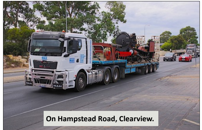
On Hampstead Road, Clearview.