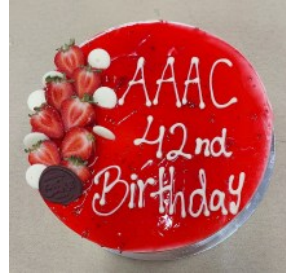
Ex-Presidents cut the Birthday Cake at the February Club Meeting