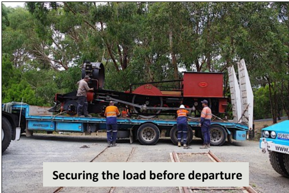
Securing the load before departure